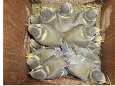
NRC No: 623, Blue Tit nest, 13+ young, primaries over 2/3 emerged, 05/06/2010.