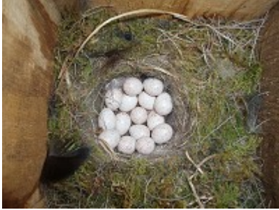
NRC No: 623, Blue Tit nest, 15 warm eggs, 14/05/2010.